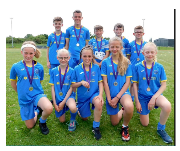
We have also qualified in the Y3/4 Tennis County finals.

Our Y5/6 came 2nd out of 12 in the Quad Kids Athletics Competition.